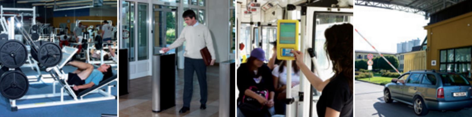
A range of applications.

Contactless cards come in standard ISO format or clamshell format. Most of the ISO format cards are made from white PVC with a glossy surface, which allows the client to customize the cards through printing. A magnetic strip (HiCo, LoCo) can be added for multiusage cards.